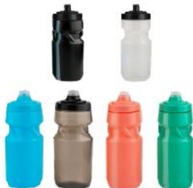
GBC-072 Capacity : 750cc Material : PE