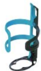
GBC-069 Material : plastic raw color the special design to change 3 pieces by an "8" plastic part recommend for standard bottle and pet bottle color: blue / red