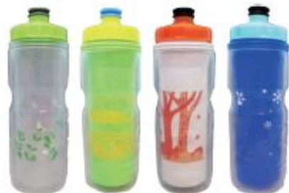
GBC-070 Capacity : 450 c.c. Mini TPR Nozzle(Mouth) Material : PP