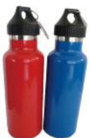
GBC-055/GBC-055-1 Material : 304 Stainless Steel Capacity : GBC-055: 350 c.c GBC-055-1:600 c.c