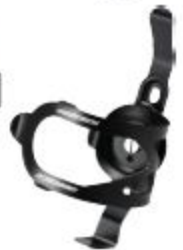
GBC-054 Double Side bottle cage Material : Alloy Color : Black / Silver