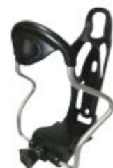
GBC-071 Available 350ml ~ 1000ml All bottle size are available Material : Adjustable Cage