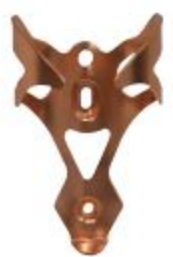
GBC-056 Material : Alloy