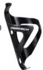
GBC-065 Full Carbon inside is UD & outside is 3K Weight :27g