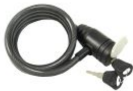
GLO-022 Key Cable lock

Material: Steel Size: 105mm x 180mm COLOR : Gold / Silver / Blue / Red / Orange / Black