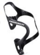
GBC-066 Full Carbon inside is UD & outside is 3K Weight :27g