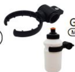
GBC-061 Material : PP