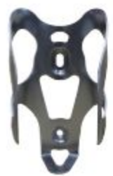
GBC-057 Material : Alloy