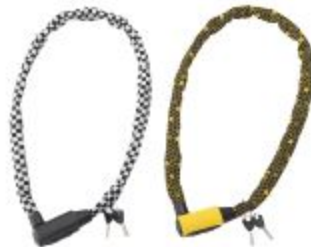
GLO-024-1 heavy duty chain lock SIZE: 6T x 36" 6T x 48"