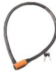
GLO-024-2 heavy duty armor lock