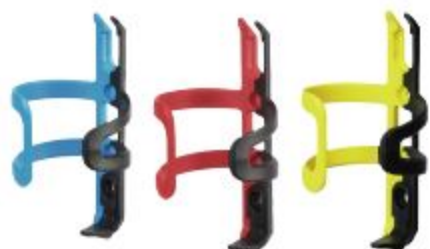
GBC-068 Material : plastic the special designed to change right or left load by an "L" plastic part color: blue / red / yellow