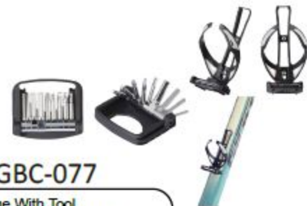
GBC-077 'Bottle Cage With Tool Material : Nylon+Glass Fiber Color : Black / Red / Green / Wolet