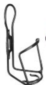
GBC-067 Material : Alloy