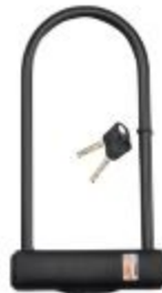
GLO-023 12mm shackle, with bracket SIZE: 110 x 230mm 110 x 300mm