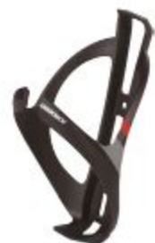
GBC-078 Material : Plastic Color : Black / White